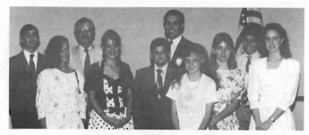
DRUG AWARENESS ESSAY CONTEST WINNERS Grand Prize Winners

(These winners, one 8th grader from each Intermediate school in the CCISD received a plaque and an all-expense trip to Space Camp in Huntsville, Alabama)